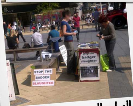
anti-badger cull stall in broadmead