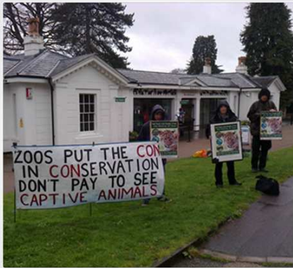
demo outside bristol zoo

We hold regular meetings every fortnight. If you would like to get involved or want to find out more please contact us!